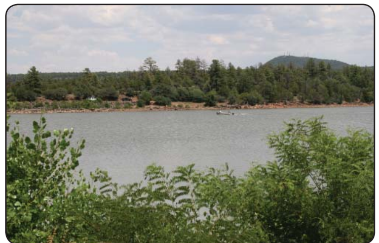
A picturesque view of Show Low Lake, a popular destination for campers, boaters and fishing enthusiasts.

The previous owner, Phelps Dodge Corporation, abandoned its water rights to the lake and deeded the lake and related property to the City in late June. Show Low Lake was constructed in 1953 by Phelps Dodge, one of the world's leading producers of copper and molybdenum. Phelps Dodge pumped water from the lake over the Mogollon Rim into the Salt River basin for its mining operations in Morenci.