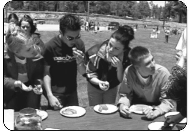
Some brave souls at the pickle-eating contest.

Over a year was spent planning the celebratory events, which were all free and open to the public. On May 2, a time capsule was buried in front of the Show Low Police Department. Filled with items to remind future residents of what our city was like in 2003, it will be unearthed 50 years from now. A talent show featuring