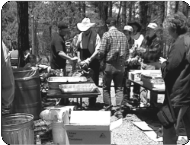
Getting ready for the hungry crowds at the barbecue.

Thank you to our sponsors and volunteers for your generosity and hours of labor to make this celebration possible.